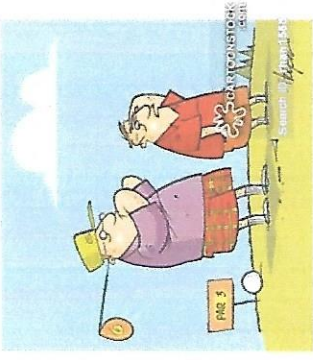
IT'S OK, I THINK HE'S MOVING.

Saturday, June 23 rd , 2018 Pine Creek Golf Course 1835 Logue Rd, Mount Juliet, Tn 37122 Shotgun Start – 8 AM