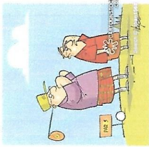
IT'S OK, I THINK WE'VE WON!S