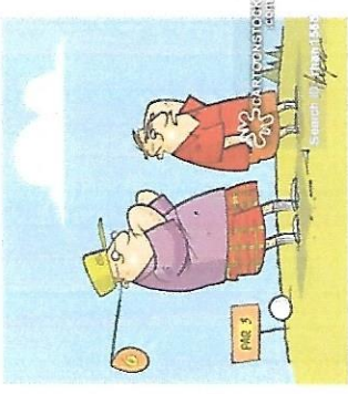
IT'S OK, I THINK HE'S MOVING.